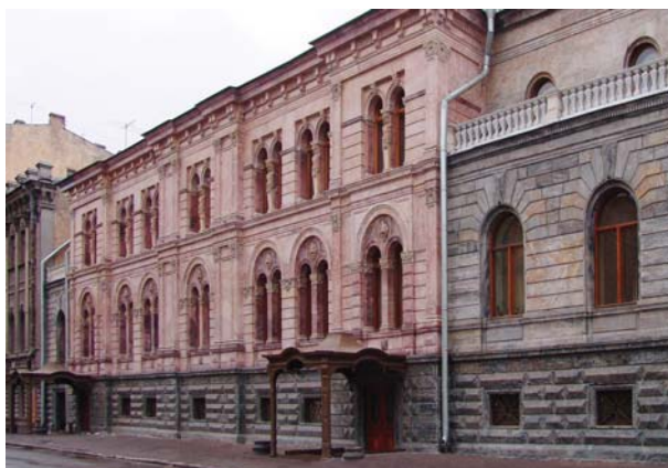
The building of the European University at St Petersburg is a beautiful palace. The marble facade in the style of Italian Renaissance brought about the building's informal name of the Smaller Marble palace.