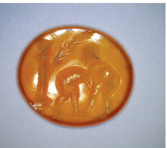
Sl. 5 - Fig. 5