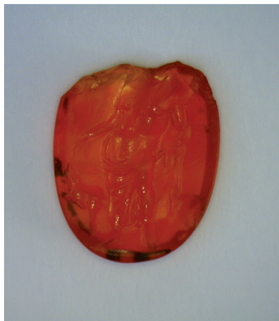
Sl. 2 - Fig. 2