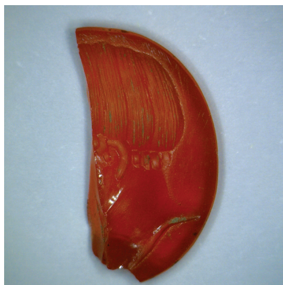
Sl. 6 - Fig. 6