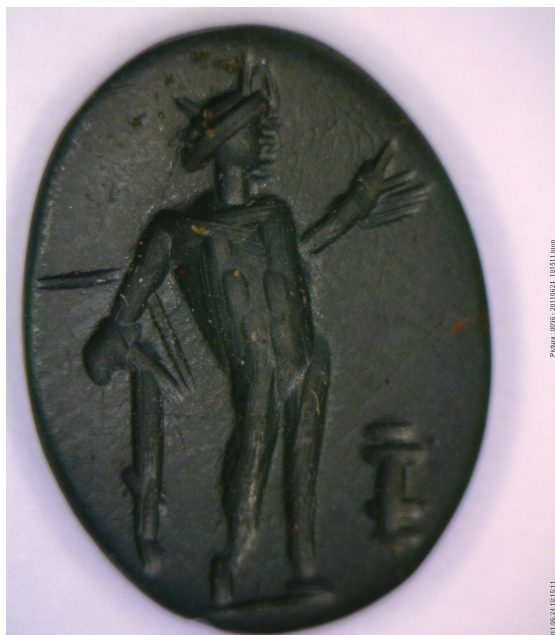
Sl. 1 - Fig. 1