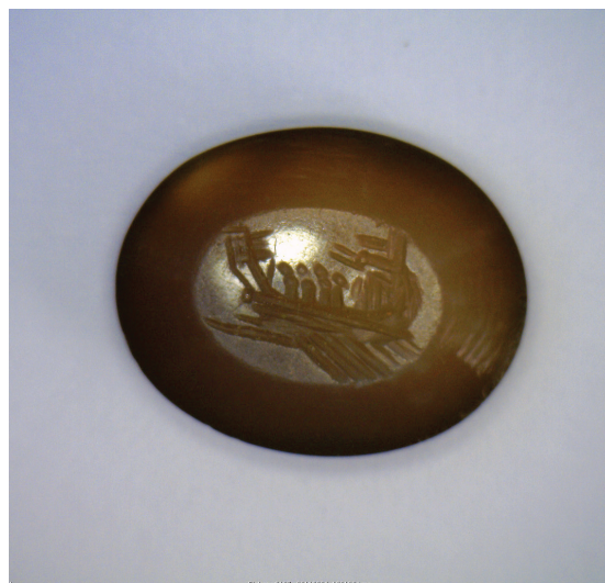
Sl. 4 - Fig. 4