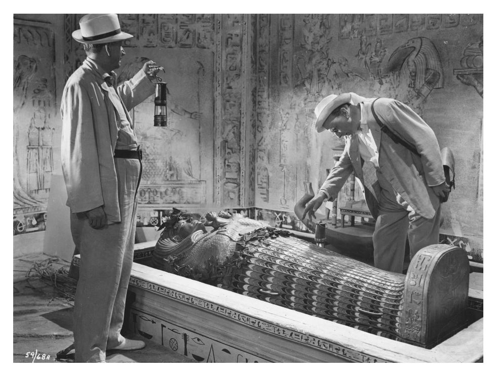
Figure 1. The western appropriation of the Egyptian dead – the moment of discovery of the sarcophagus of Princess Ananka in The Mummy (UK 1959). As a consequence of this discovery the English archaeologist on the right will become the first victim of the Mummy. The fibreglass sarcophagus is now in the collections of Perth Museum and Art Gallery, Scotland, UK.<sup>1</sup>

Egyptian archaeology fares little better in non-horror films. In the science-fiction adventures, Stargate (1994) and The Fifth Element (1997) otherwise plausible, historically-set archaeological investigations in Egypt are linked to visits by aliens and in the former, the Rosetta Stone proves to be a gateway to another universe. In The Raiders of the Lost Ark (1981) we see large-scale excavations under way at the City of Tanis, in the Egyptian desert. Often, but not exclusively, such forays are set in the 1920s or 1930s and so often display hundreds of Egyptians as the labouring force under foreign, imperial archaeological control (see Fig. 2). Things may be less overtly supernatural in these films but Egypt is still commodified and closely bound as a representation of the Oriental 'Other'. As Meskell (1998a:73) observed of the film Stargate : 'Egypt represents everything Other, everything we cannot fathom or explain, all things ritualized, sacrificed and sexual' and summed up in the film as the queered, extra-terrestrial Ra, like Egypt identified as inexplicable, unnatural and evil.